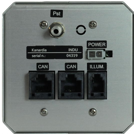
Figure 3: Back view of the 80 mm instrument with connections.